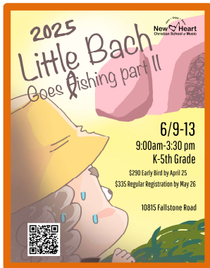
Little Bach camp

In February and April, our team ministered in several churches in New York, New Jersey, and Akron. We are thankful to witness many hearts turn back to Him. New Heart Brazil also conducted a JAM camp in January as well as worship training and a worship retreat in April to equip and renew worship team members currently serving in their local churches. Preparations for our various summer camps in the United States are kicking into high gear. Please ask God to personally touch the lives of the children and youth who attend these camps.